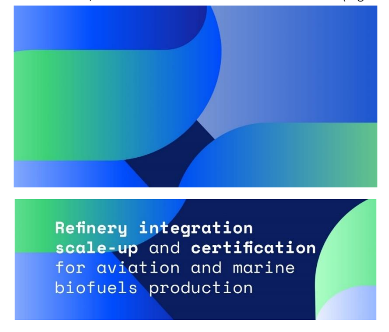
Figure 8 -Backgrounds for REFOLUTION social media channels

• Backgrounds in several formats, for the web and for social media channels (e.g. Twitter, LinkedIn, etc.):