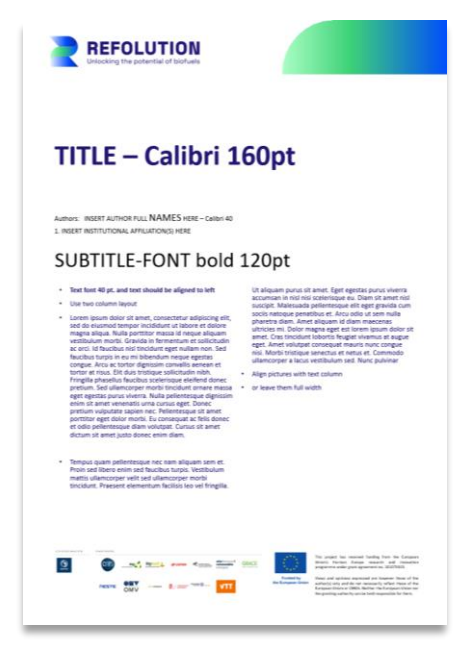
Figure 6 - Template for project posters in A0 dimension