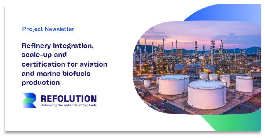
Figure 9 - Canva template for the project newsletter

Canva templates for newsletter cards, infographic and social media posts: