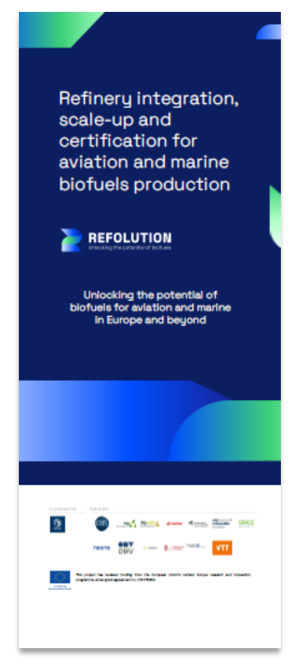
Figure 7 - Project roll-up (preliminary layout)

• the preliminary layout of the project roll-up , to be displayed in occasion of events organized or coorganized by the REFOLUTION consortium: