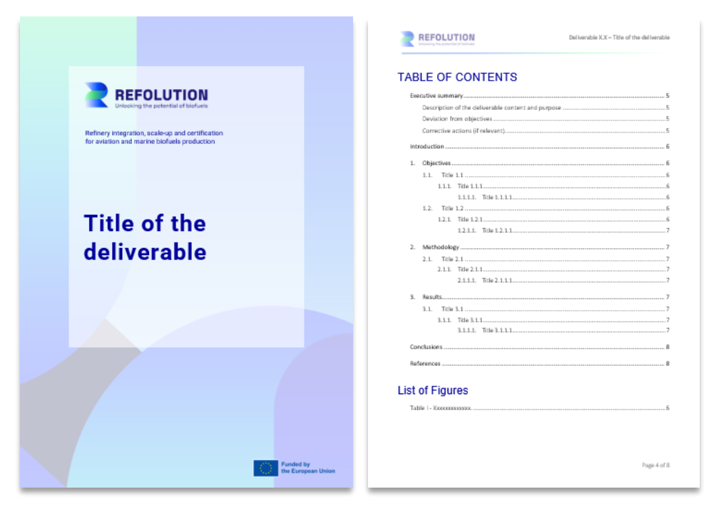
Figure 4 - Template for project deliverables/reports

• a Word template for project deliverables/reports (which can be used as a basis for other documents e.g. project meetings agendas, etc.);