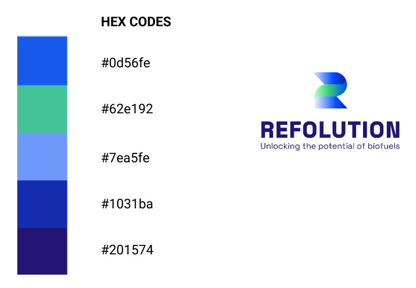
Figure 2 - Colours specifications of REFOLUTION logo.

A full logo set has been created for making it available in several formats (for digital, print versions and the vector ones). This will permit the consortium to use it in several project communication and dissemination materials (on paper and digital means, on white, transparent or a black background). Here below some examples of logo declinations are provided: